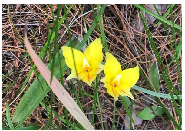
Cowslip orchid Caladenia flava

The spring flowers have started with the first donkey and cowslip orchids as well as greenhood and jug orchids making their appearance.