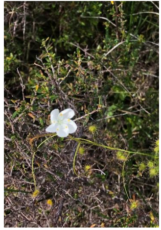
Sundew - Drosera pallida